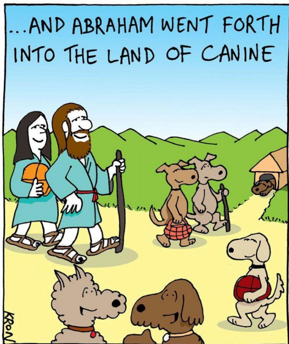
The CARTOON KRONICLES