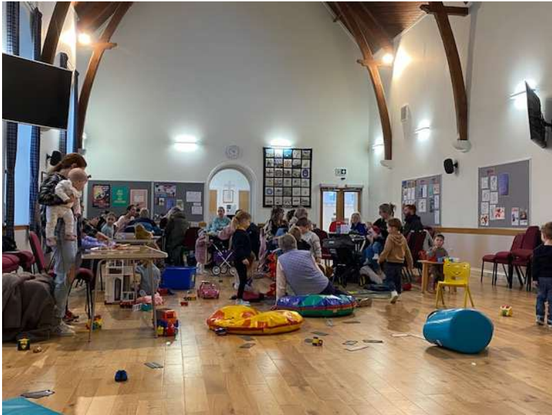
A new term back for Well Café and below 'To mark Burns Night, children (and parents!) at the Well Cafe worked together on a Saltire collage - great job!'